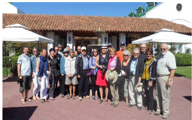
Doctors-on-Tour - Chile & Argentina