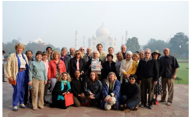
Doctors-on-Tour - India