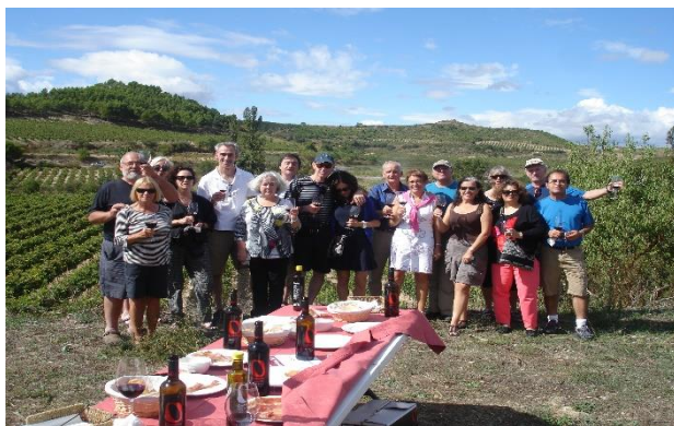
Doctors-on-Tour – Spain